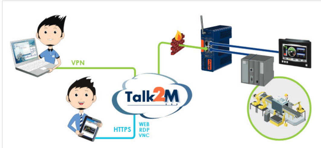
Fig. 1 Talk2M overview

To connect to the Ewon VPN router, remote users run eCatcher, the VPN client software, to connect to the same VPN server.