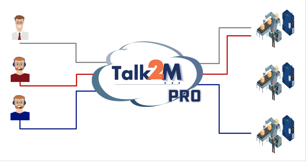
Fig. 5 Example of concurrent connections

Concurrent connections refer only to eCatcher connections! Simultaneous connections through M2Web and eCatcher mobile are unlimited.